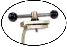
Aerial Strand Clamp 4035-A

Lightweight and hand-operated. When proper crimping pressure is reached, a bypass valve opens.