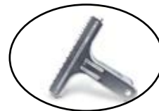
Cover Removal Tool 4053

Used to terminate individual conductors on MS 2 modules.